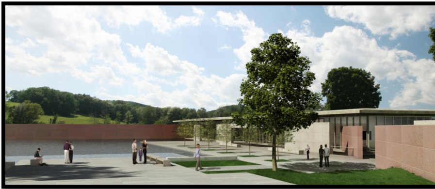
Figure 1: Rendering of the new addition

The Sterling and Francine Clark Art Institute new addition consists of high end art galleries and research labs located in Williamstown, MA. The growing number of students and the fact that the museum became well known in the world of art were the reasons of the need to build a new addition to the existing building. The addition of this new facility costs $28 million where Turner Construction is the General Contractor on the project. The state of the art new addition is designed by the famous Japanese Architect Tadao Ando. It is made up of one floor and a basement and has a size of 68,000 SQF. The construction of the project started on January 2011 and is scheduled to complete on September 2013 with a design bid build delivery (DBB) method and a guaranteed maximum price (GMP) contract.