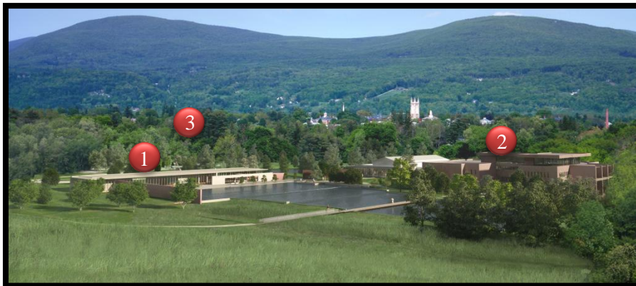
Figure 2: New addition location in respect with surroundings

The site for the new addition is relatively not constrained where it is next to an existing building called the Manton and the main parking lot. In figure 2, mark 1 shows a rendering of the new addition, 2 shows the Manton, and 3 for the parking lot.